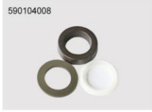
#26.BM18 Main Water Seal

NOTES: 01 WATER SEAL KIT ITEM#24+ITEM#26